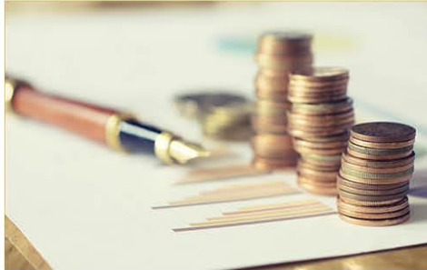
Monthly Salary Net BPJS Kesehatan