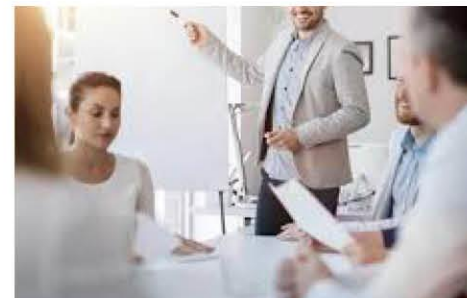
Training External & Internal