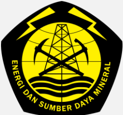
Badiklat Kementerian ESDM