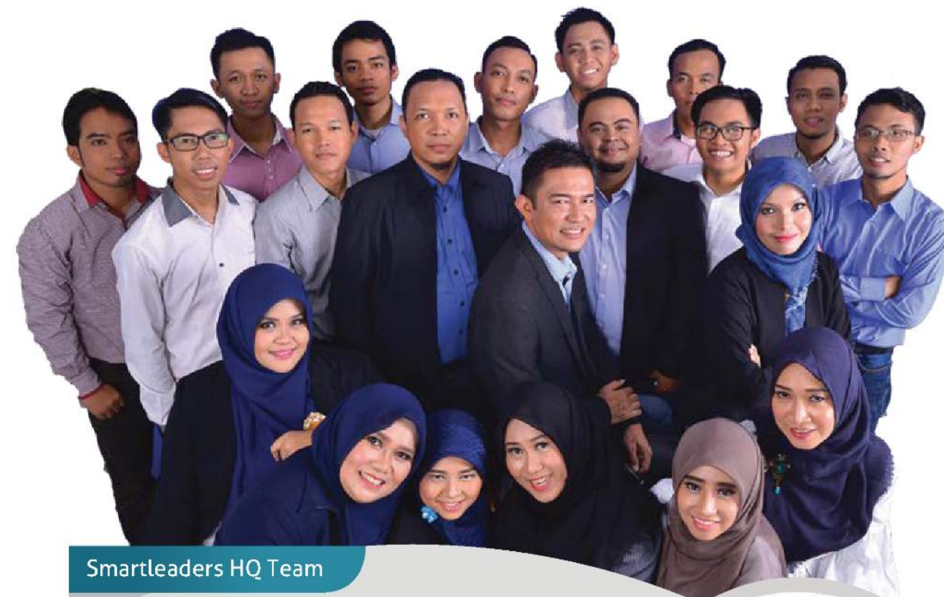
Smartleaders HQ Team

“ We are qualified We are young, energetic and enthusiastic If you have a problem, that no one else is willing to take, Please try us. No need to pay anything, if our products can not solve your problems. ”